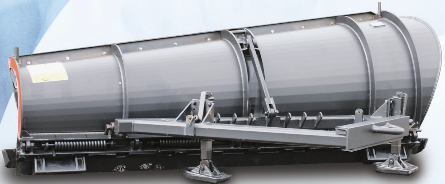
Tapered Plow with 1WT Table, QCP Loop and Trip Edge shown

Gledhill Tapered Moldboard Snow Plows are available in the ‘TB’ Series where the “Built-In Baffle” is an integral part of the Moldboard.